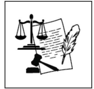
appeal tribunal act

kīthci nōtāpwīwasinahikan ᑎ"ᑦ ᓃᑕᑦᑦᑦᑦᑦᑦᑦᑦᑦ