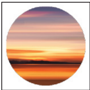
pī sākāstiw ፳፻፳፻፳፻፳፻