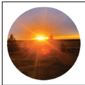
atōh otāhkosiṅ ፳፻፳፻፳፻ ፳፻፳፻፳፻